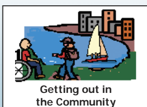
Getting out in the Community