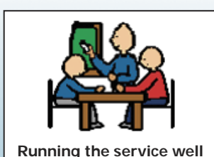
Running the service well