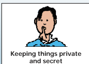
Keeping things private and secret