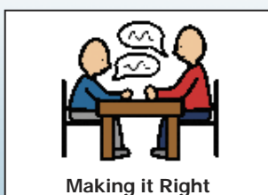
Making it Right