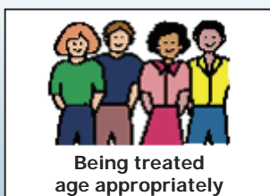
Being treated age appropriately