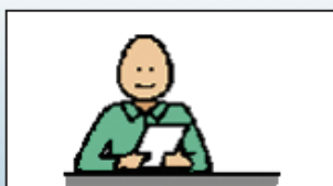
A plan for what YOU want